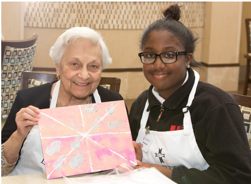
2019 Grant Recipient Lourdes Senior Community is using their grant award to fund a program which seeks to teach respect and dignity of seniors as high school students engage with our residents living with memory loss. Lourdes Senior Community has cared for seniors for over 70 years and is sponsored by the Dominican Sisters of Peace.